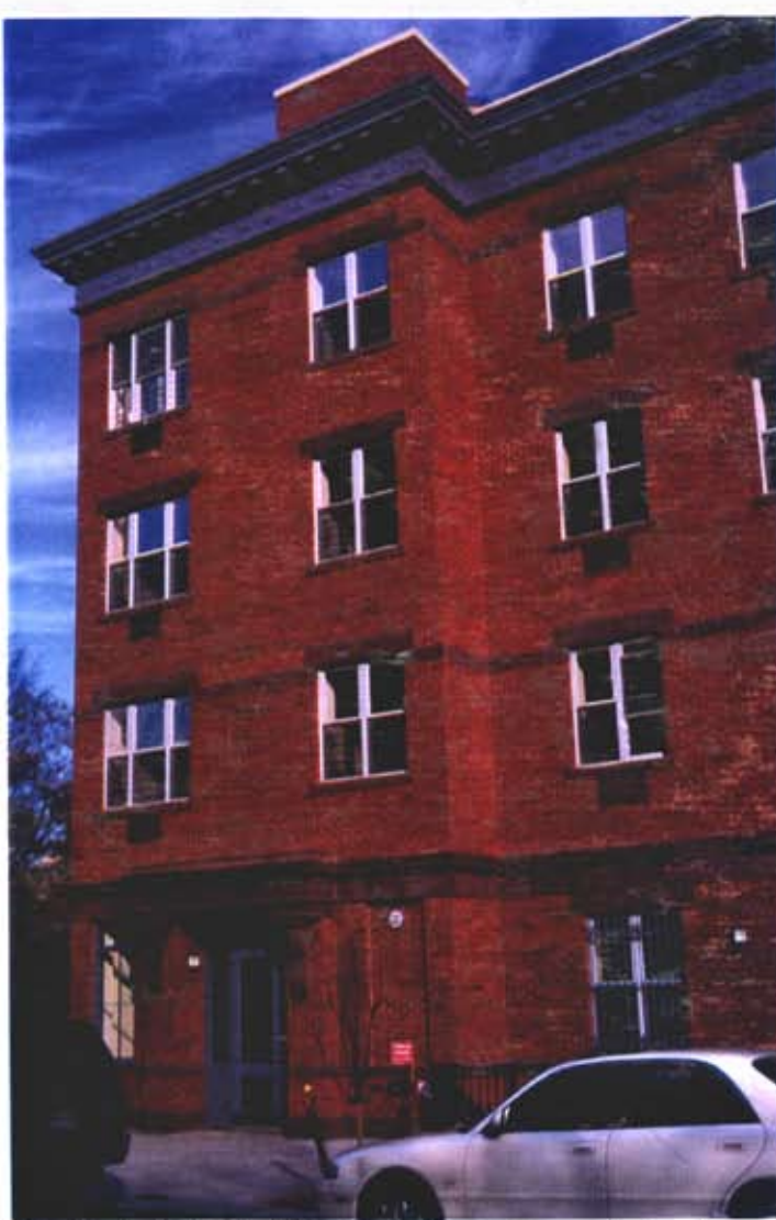
This historic-looking building in Brooklyn, N.Y., is actually brand new. Cindy Harden designed her Warren Street development to match a historic neighborhood with cost-saving, old-fashioned details like a fiberglass cornice and pre-cast concrete lintels.

Split-faced blocks, a relative of the cinder block, commonly grace the sides of